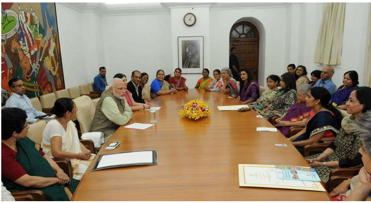
(PM Interacting with Awardees)

Ministry of Women and Child Development gives away the Award to Institutions and Individuals for their contribution to the society for women empowerment in the country on International Women's Day. TIFAC was awarded under the institution category for its work for KIRAN-IPR. The Award consists of a citation and a cash prize of rupees two lakhs. Hon'ble Prime Minister met all the awardees and interacted about their contributions.